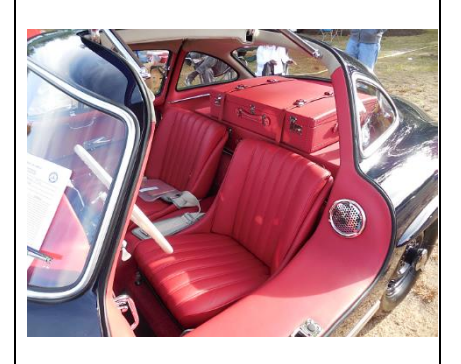
A Beautiful Gullwing! We were graced with another Gullwing which was driven by Nat Lanza, a 1957 300SL