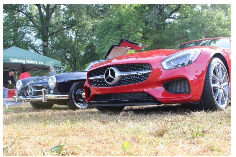
Four Gullwings Visit Great Marques 2015