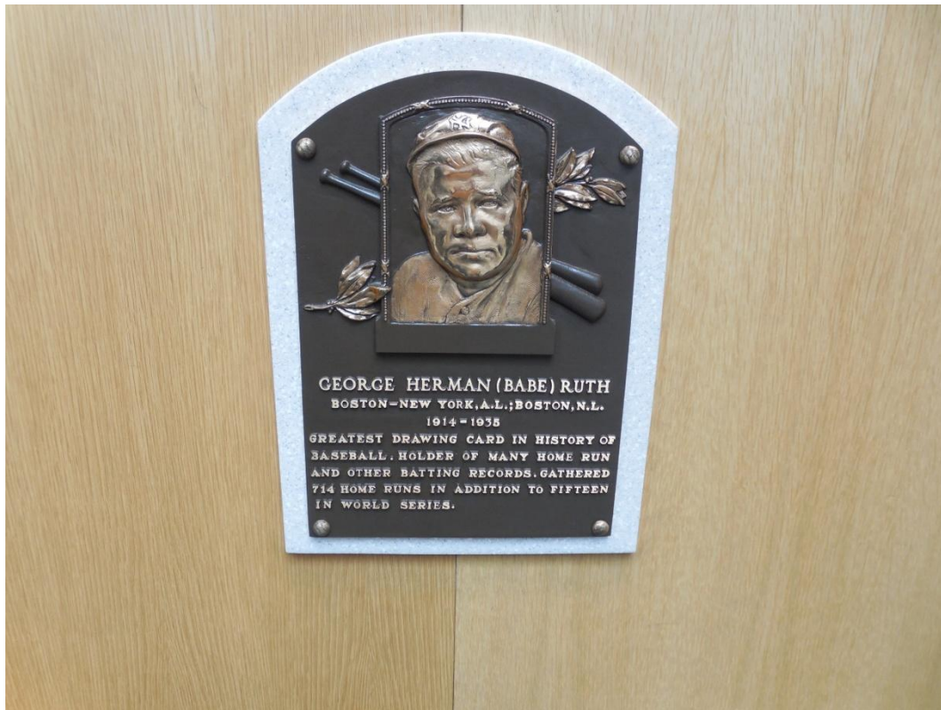
"The Babe" - Hall of Fame - Cooperstown, New York.

What makes the drive so comfortable? The plush seats never got hot for my trip and multi selection of the six way adjustable seats removes the fatigue factor. All the controls were logical and did not require constricted poses to adjust. All in all – a panoramically generous wind screen allows for ultimate road and scenic viewing as miles melt away.