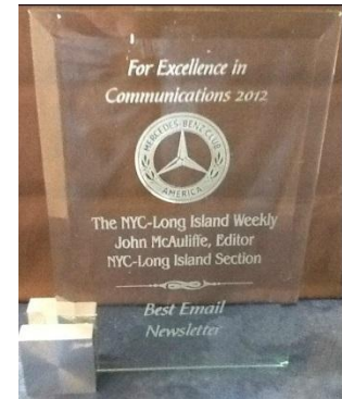
MBCA Excellence in Communication Award! 2012