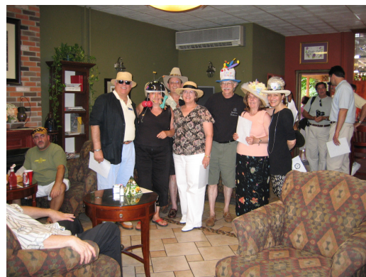
THE HAT CONTEST