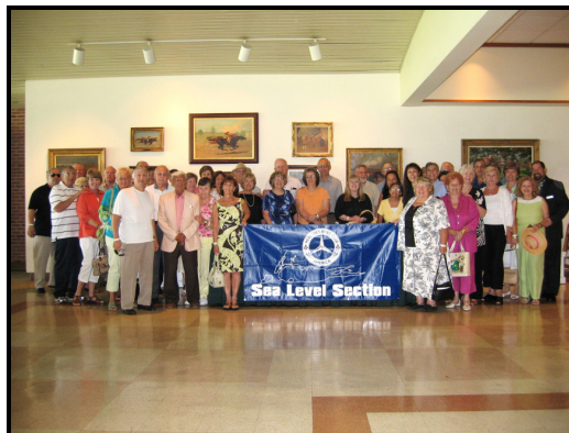
Sea Level members show their colors