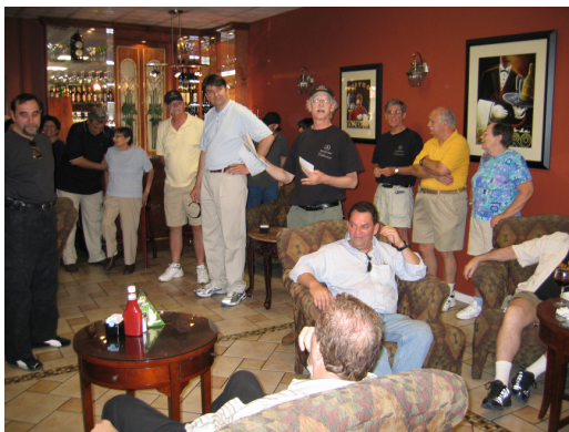
AWARDS BEING GIVEN OUT