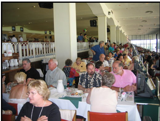
Sea Level members & guests in Terrace Room