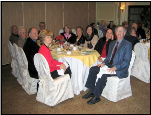
Members & Guests enjoying the Holiday Party