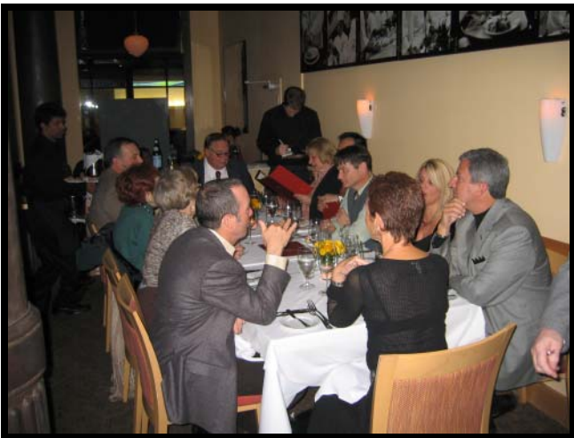
Sea Level members & Their Guests