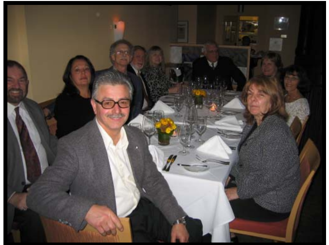
Bon Appétit. Board Members & Their Guests