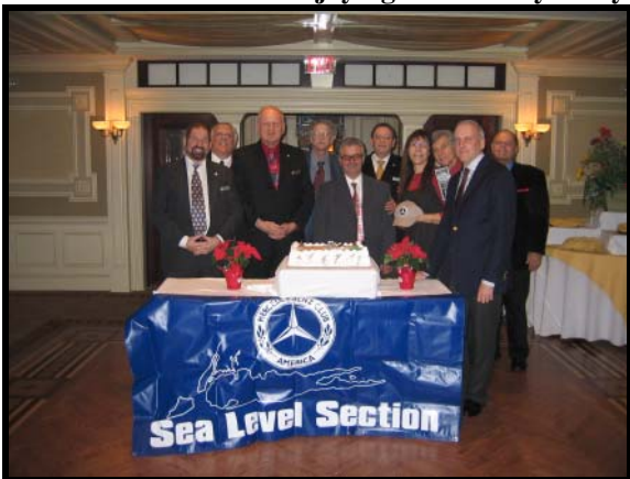
Sea Level Officers and Board Members