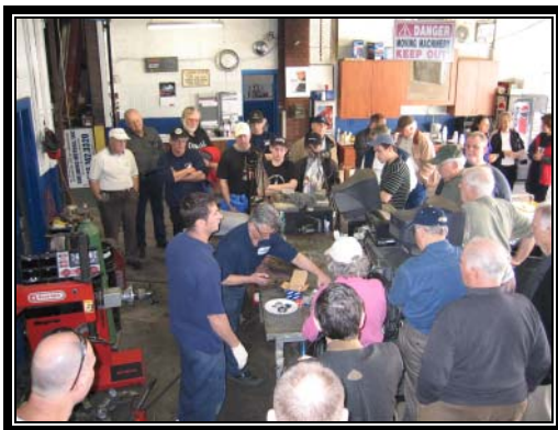
Wheel Bearing Service

All went away knowing a little more about their Mercedes, and the importance of proper maintenance.