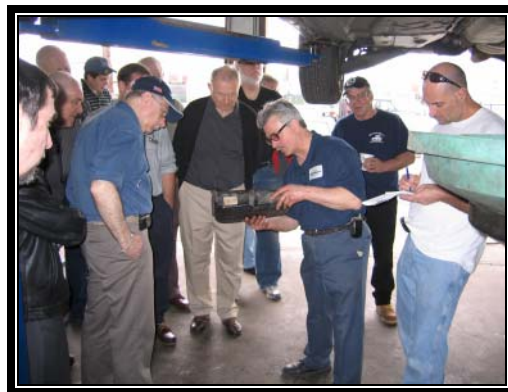
Automatic Transmission Service