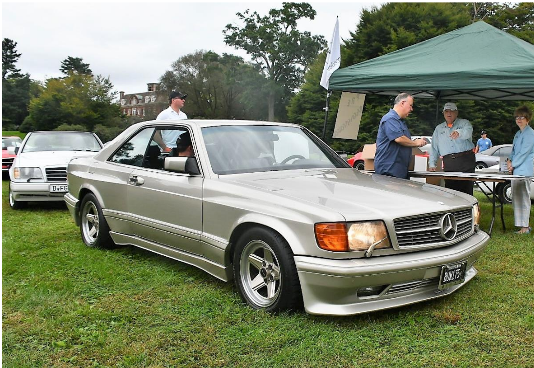
2019 Great Marques at Old Westbury Gardens