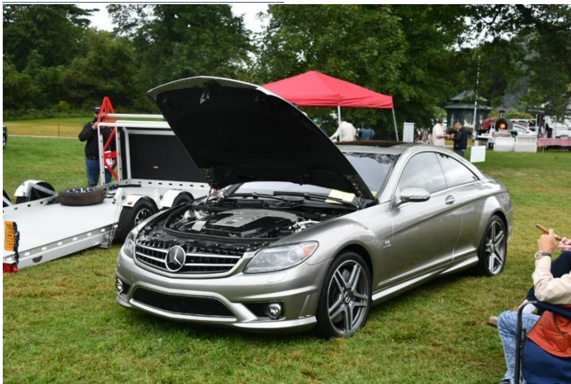
Great Lawn Old Westbury Gardens -Great Marques 2019