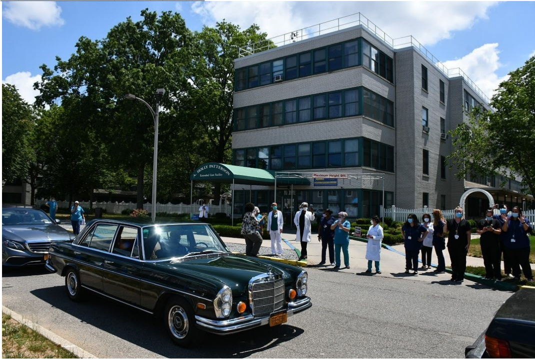
2020 – Healthcare workers Appreciation Drive