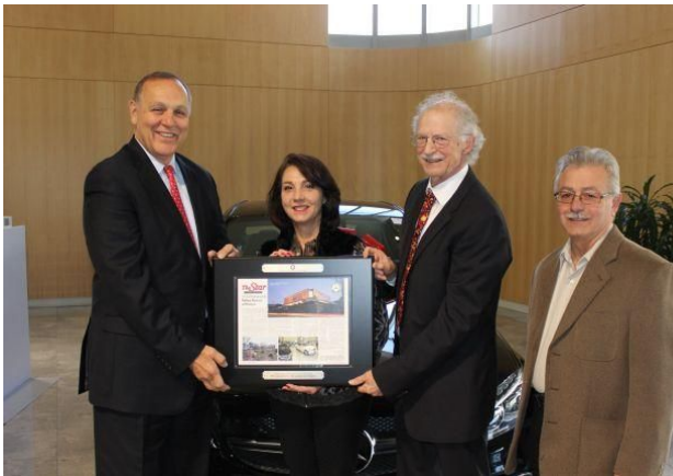
Rally Mercedes-Benz STAR Dealership Presentation 2016

4) Stock Car collection Sunday, May 21st