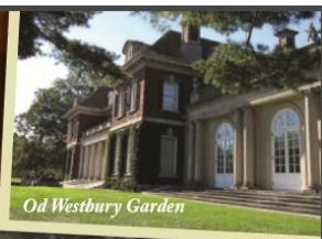
Old Westbury Garden

For information contact Oliver Selligman 917.763.0178