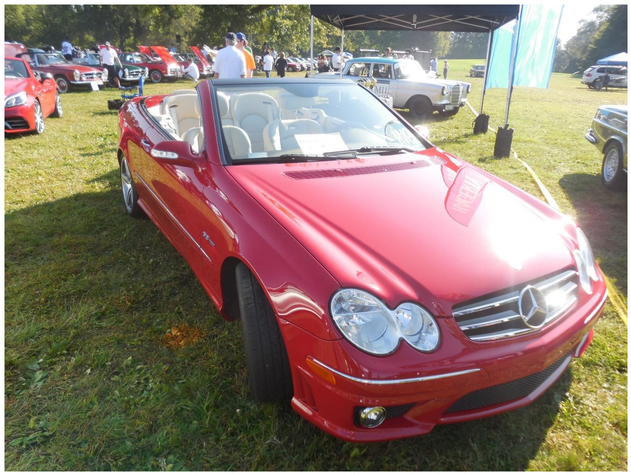
What could be better this holiday season than Santa delivering joy to children in a shiny red sleigh like this one?

Our section will again, subsidize the cost of each participant for this event. Our venue is the renowned Inn at New Hyde Park. The cost is $45 per person. Children under 12 are free and Santa will visit them. Send your check made out to MBCA.