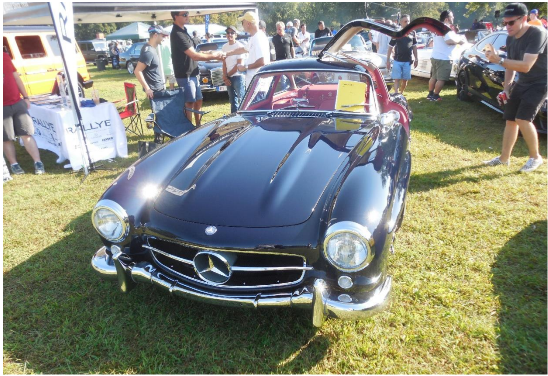
Nat Lanza's 1957 300SL