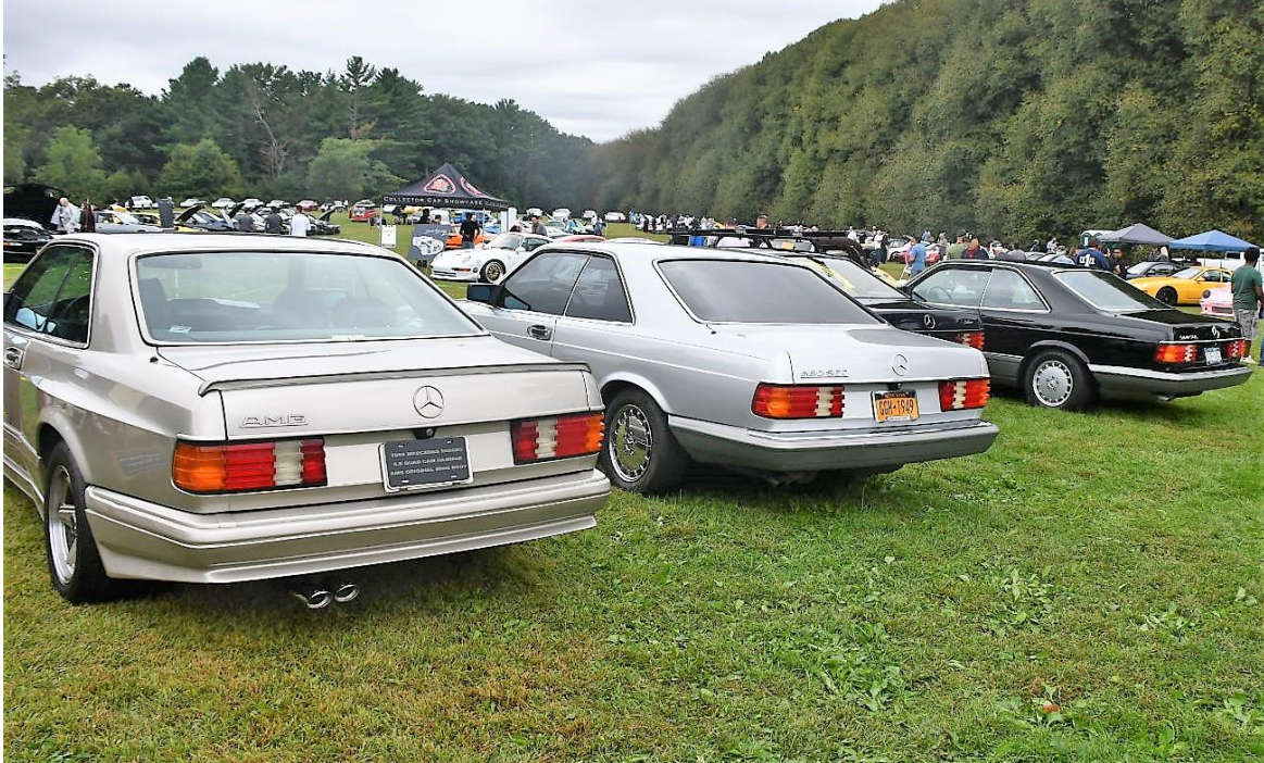
The Great Lawn – Old Westbury Gardens 2018

The latest Star Magazine - As a member you receive award winning issues like this!