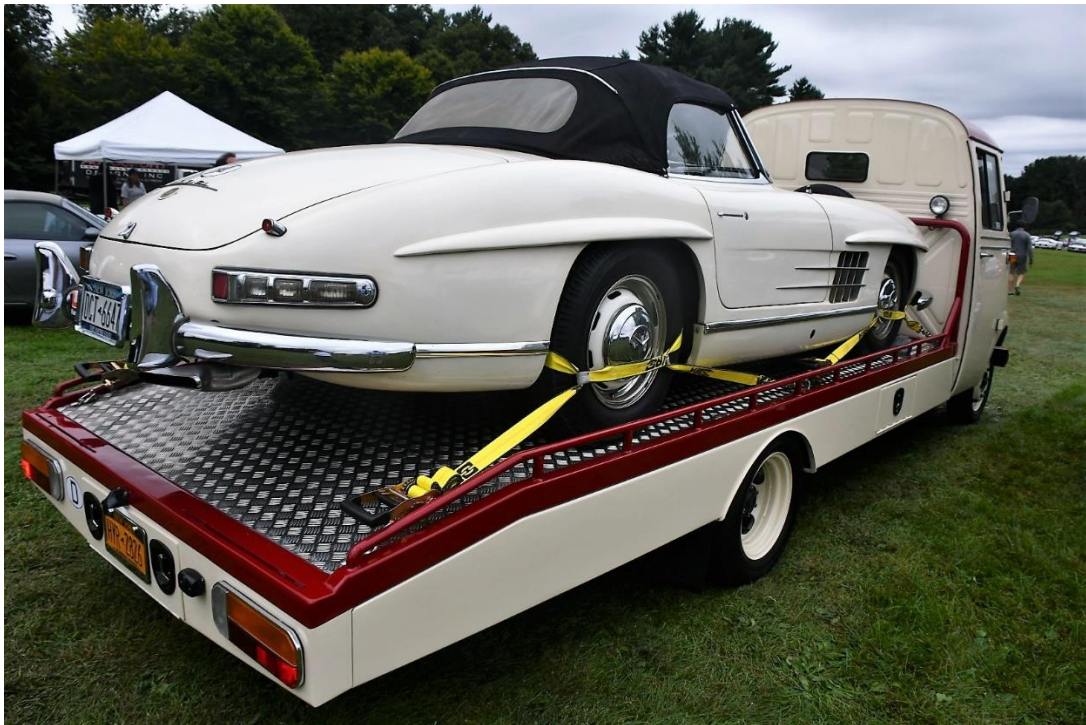
A classic 300 SL getting a ride! - Photos by Sean Aryai