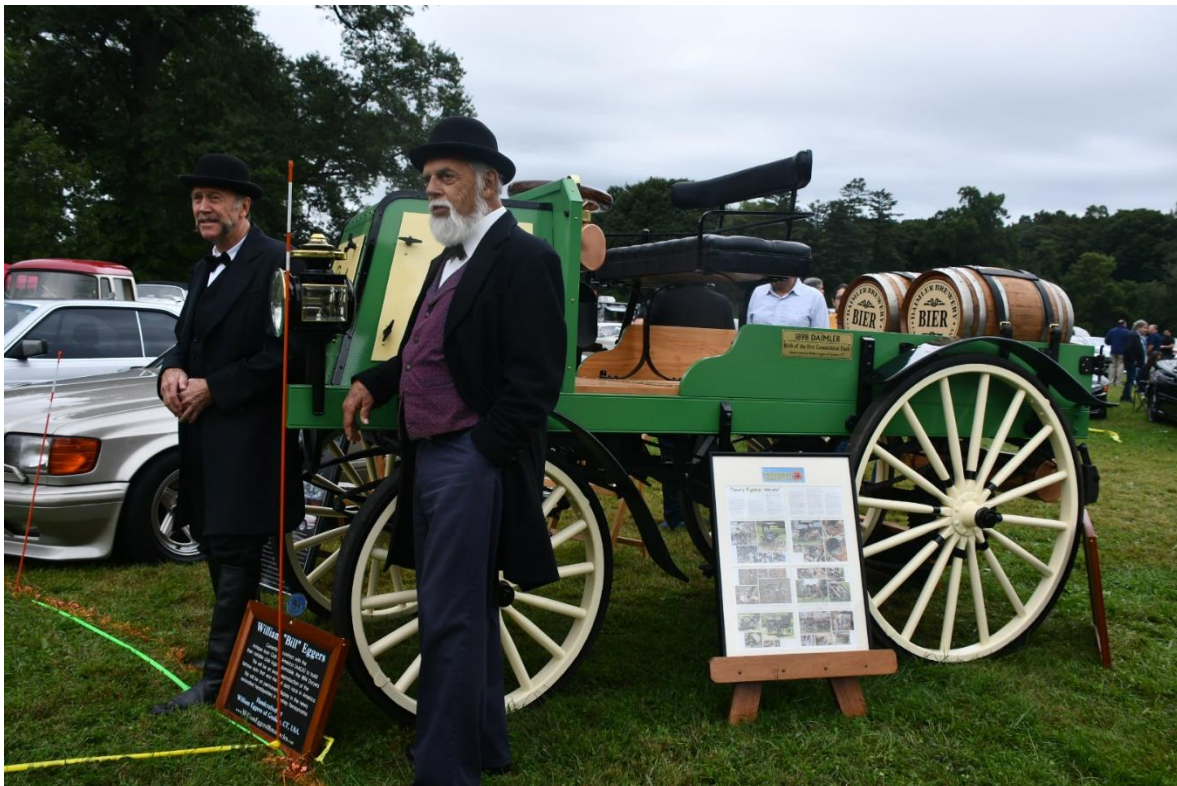
Great Marques 2018