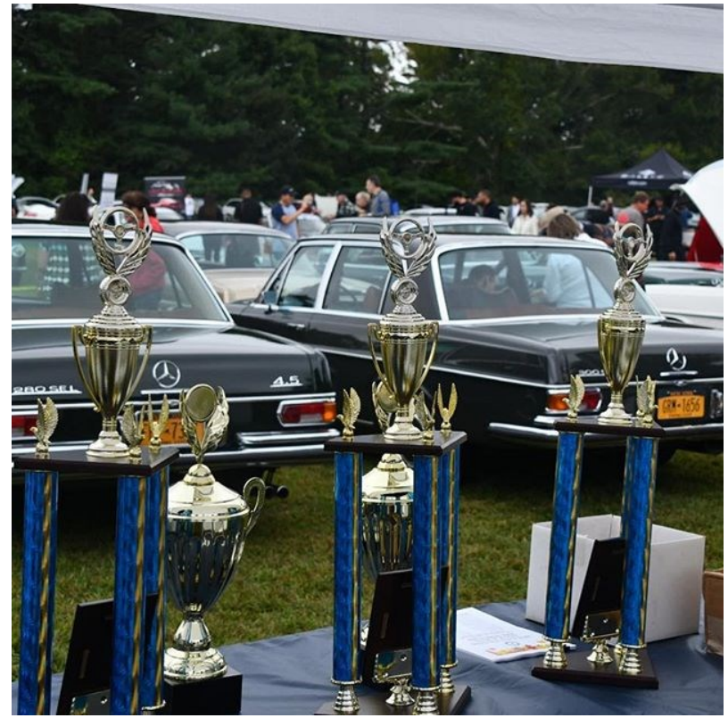
2019 Great Marques at Old Westbury Gardens