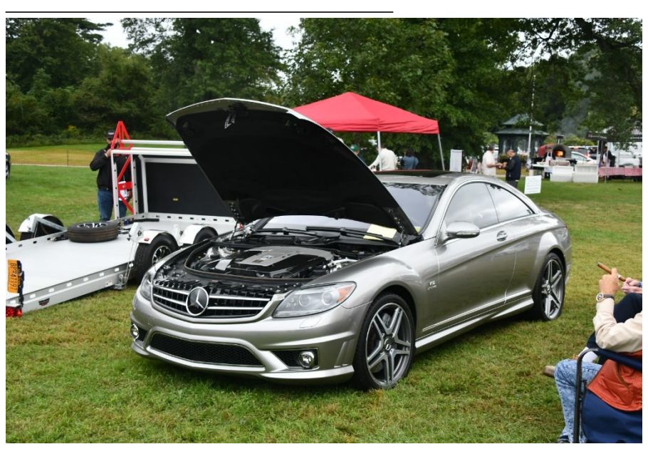
Great Lawn Old Westbury Gardens -Great Marques 2019