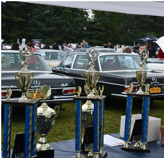
2019- Great Marques at Old Westbury –