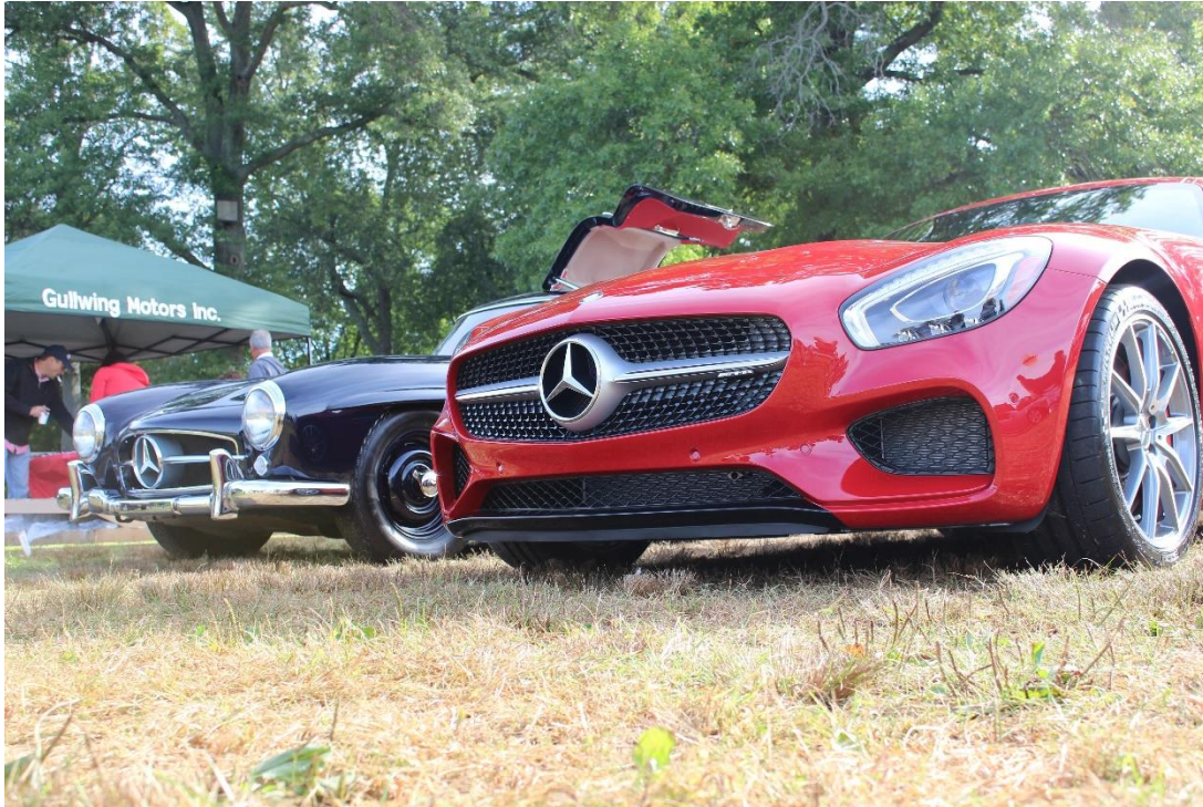
Great Marques 2015 "Old and New 300 SL"