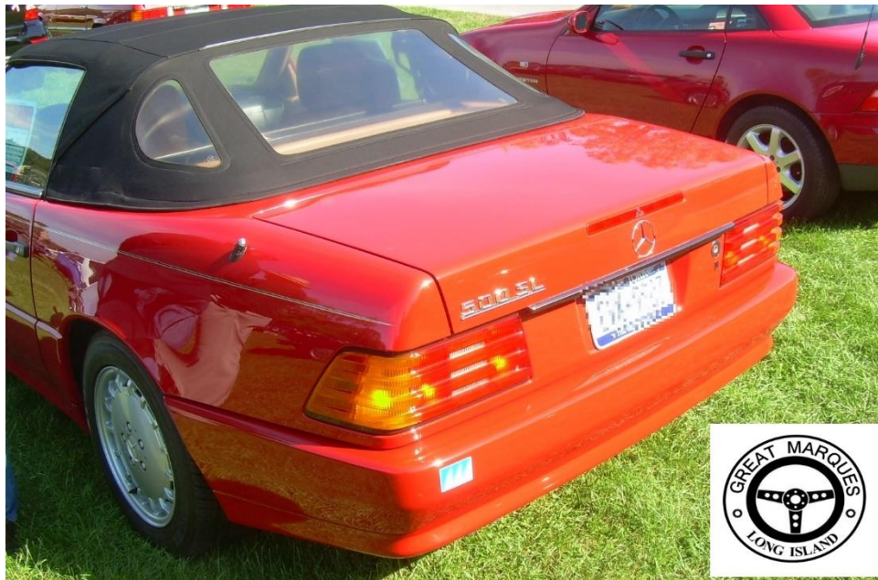
Star Cars lined up at Old Westbury Gardens