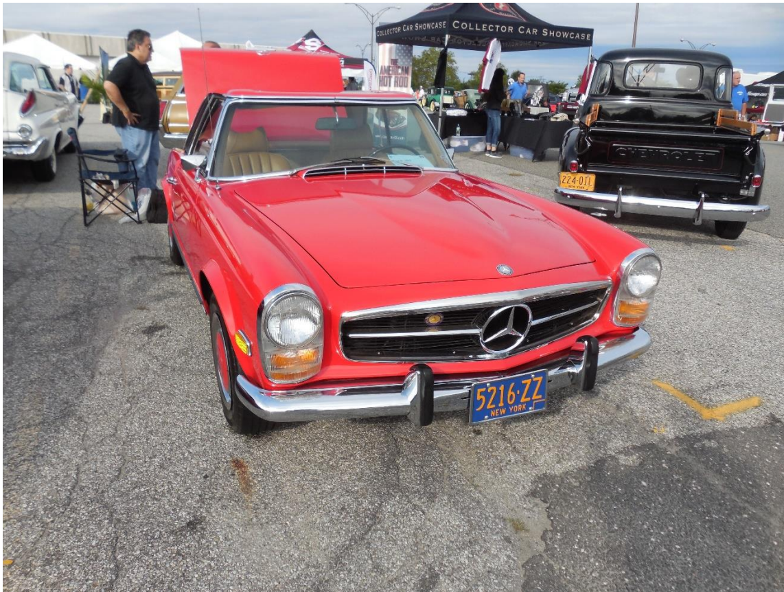
2015 Long Island Cruizin' For Cure

Transmission Automatic Exterior Blue Interior Blue Leather We are selling a beautiful 1979 450 SLC. This vehicle was a one owner car and it only has 72,xxx original miles! It was very well maintained inside and out and kept clean as well as the engine bay! Contact: Gullwing Motors, 100 WINDSOR AVENUE MINEOLA, NEW YORK 11501 TEL: 516-742-3320