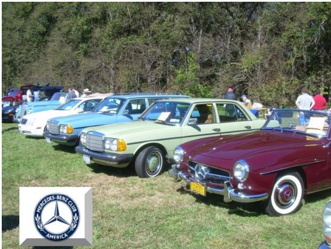
Great Marques 2015