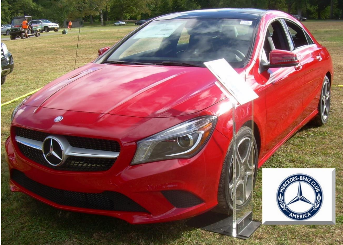
2015 Great Marques – A Rallye – Mercedes on the field.