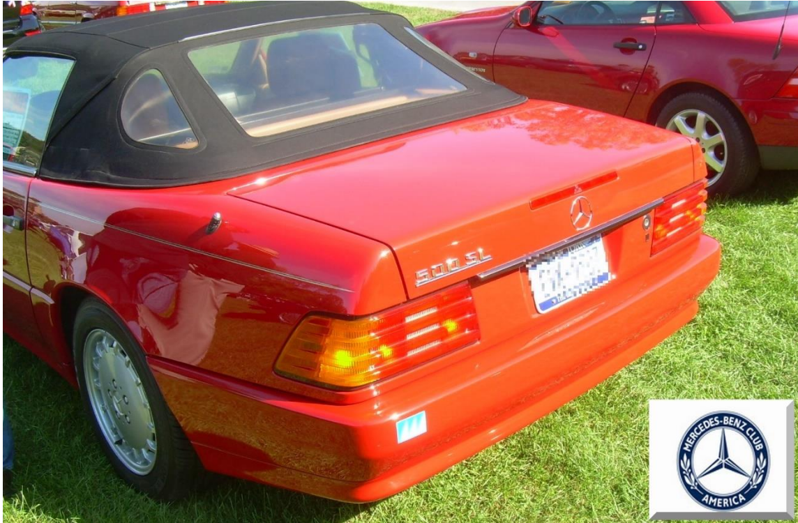
2015 Great Marques – Mercedes on the field.

Hi MBCA Mid-Atlantic Newsletter editors,